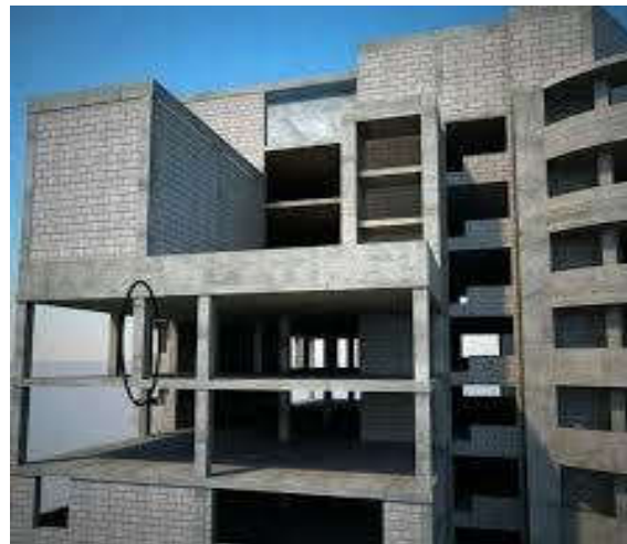
Fig.2 Typical Example of floating column