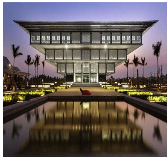
Fig. 3: Hanoi Museum in Vietnam consist of FC