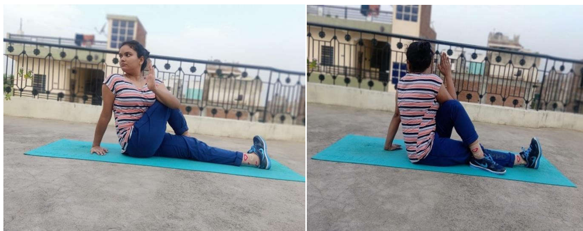
Fig. 2, 3 Ardha Matsyendrasana (side view)