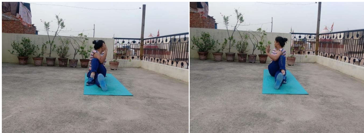
Fig..4, 5 Ardha Matsyendrasana (front view)