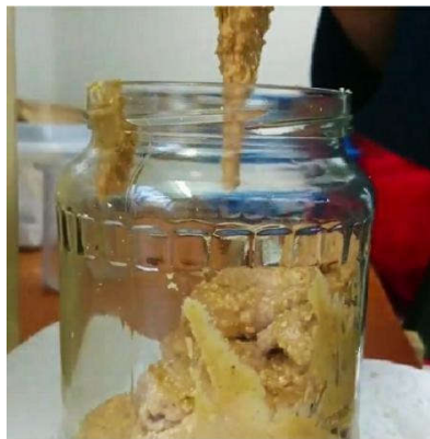
Figure 11: Grinded nut spread

Hydrogenated vegetable oil acts as a stabilizer, which prevents the oil from collecting at the top of the jar [12]. Throughout the grinding process, peanuts are kept under constant pressure to prevent formulation of air bubbles, which could cause oxidation.