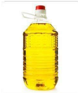
Figure 8: Hydrogenated vegetable oil