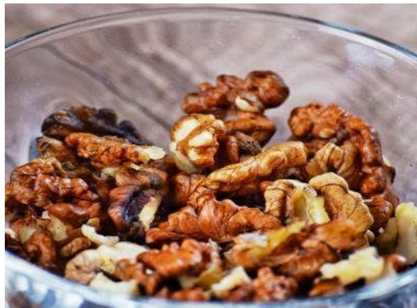
Figure 2 : Walnuts