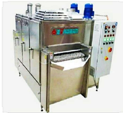
Figure 6: Nut roasting equipment

Raw nuts contains lipoxygenase, which accelerate the oxidation of damaged nuts. The lipoxygenase is usually destroyed during nut roasting, but after roasting, non-enzymatic catalysts can initiate oxidation. During this method, moisture content of nuts were reduced, browning reactions and caramelization occurs and brown pigments are formed.