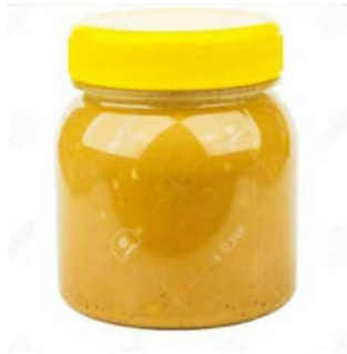
Figure 14: Prepared product

Bottles are then sealed, placed in cartons and allowed to set at 20°C for 35 -40 hrs before distribution