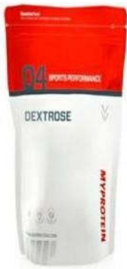
Figure 7: Dextrose.