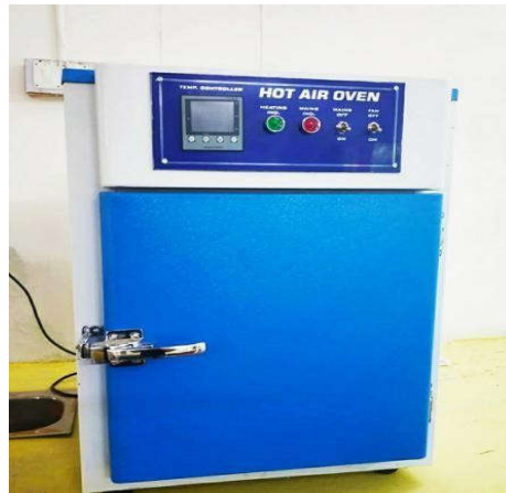
Figure 5: Hot air oven