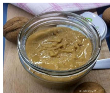
Figure 13: Prepared nut spread