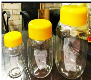
Figure 12: Packaging glass bottles

After grinding, the prepared nut spread is put into a final containers, it is allowed to remain undisturbed until it is completely crystallized [13].