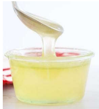
Figure 9: Corn syrup