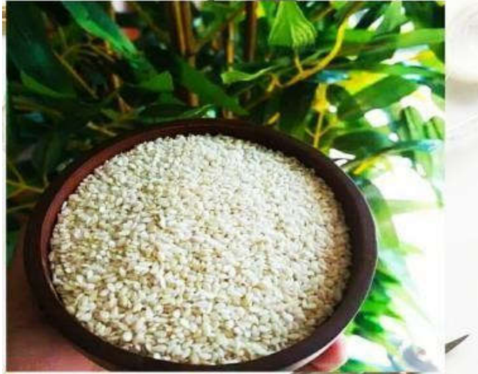
Figure 1 : White sesame seeds