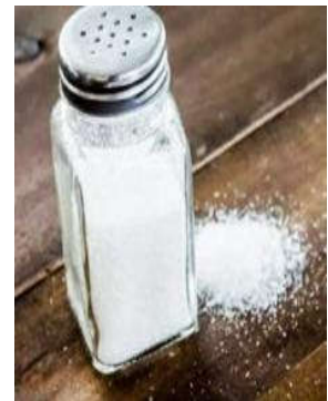
Figure 10: Salt

Hydrogenated vegetable oil acts as a stabilizer, which prevents the oil from collecting at the top of the jar [12]. Throughout the grinding process, peanuts are kept under constant pressure to prevent formulation of air bubbles, which could cause oxidation.