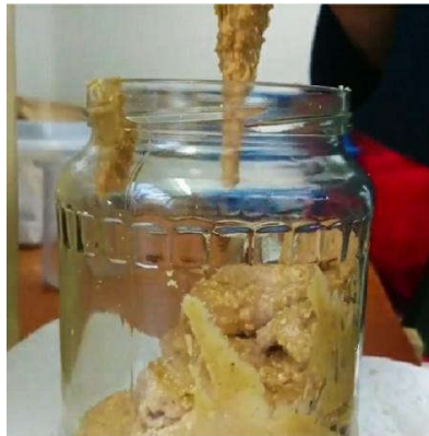
Figure 11: Grinded nut spread

Hydrogenated vegetable oil acts as a stabilizer, which prevents the oil from collecting at the top of the jar [12]. Throughout the grinding process, peanuts are kept under constant pressure to prevent formulation of air bubbles, which could cause oxidation.