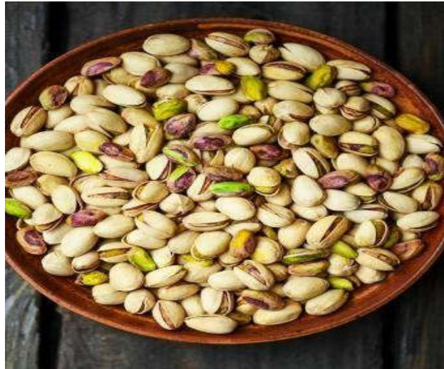
Figure 3: Pistachio