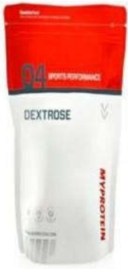
Figure 7: Dextrose.