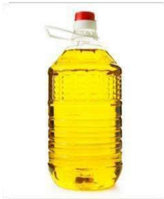
Figure 8: Hydrogenated vegetable oil