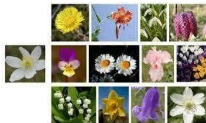
Fig 2: Sample Images from database

Finally, after several convolutional and max pooling layers, the high-level reasoning in the neural network is done via fully connected layers. Neurons in a fully connected layer have connections to all activations in the previous layer, as seen in regular neural networks. Their activations can hence be computed with a matrix multiplication followed by a bias offset.