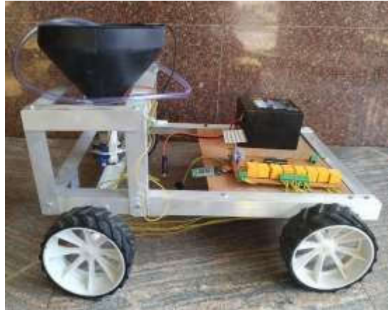
Fig 2. Image of the product